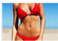
10 Flat-Belly Tricks