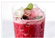
8 Cold Drinks for Your Cooler